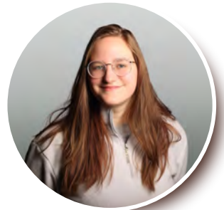
DANNI Teal Team