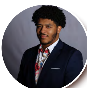
JADEN Lime Team