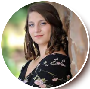
EVA Blue Team