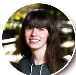
BELA Emerald Team