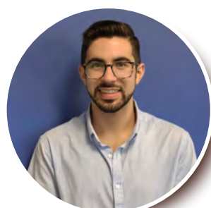
NICK Red Team