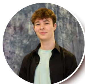
ASA Green Team